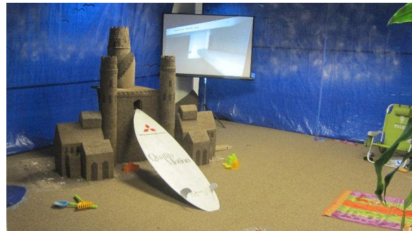
The winning Beach hole from ACTiVE Committee at MEUS-Cypress, CA.

To encourage friendly competition and recognize committees for their hard work, MEAF awarded trophies for the Most Creative Hole and Most Money Raised . The winner of the Most Money Raised (in a neck to neck race) was the PEACE Committee at MEAA-Northville, MI! In a close vote, the winner of the Most Creative Hole contest was the ACTiVE Committee at MEUS-Cypress, CA for their Beach inspired hole complete with a sandcastle, surfboard, and working elevator!