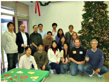
Mitsubishi Electric Volunteers at the Hope School

On November 29th, Japanese Expatriates from Mitsubishi Electric US companies came together to give back to the community and children with disabilities.