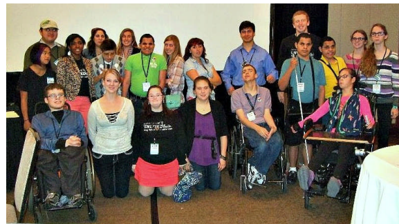
Participants at the I am Norm 2012 Youth Leadership Summit

MEAF was proud to support I am Norm's second Youth Leadership Summit at the TASH Conference in Long Beach, CA on December 1st in partnership with Kids Included Together and the National Inclusion Project .