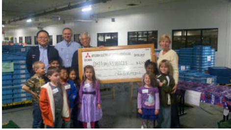
The ECHO Committee at MEAA/Mason, OH presents a check to Ohio Valley Voices after their Hallway Golf Tournament.