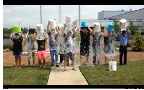
The ECHO Committee from MEAA/Mason, Ohio kicks off the ALS Ice Bucket challenge!

numerous Mitsubishi Electric friends and family across the country.