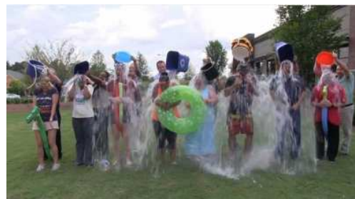
Finally, the LOVE Committee from MEUS/Suwanee, Georgia adds pool toys to the mix to get involved with the cause.