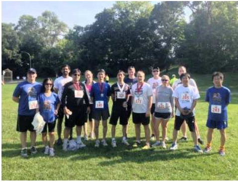
Volunteers from the PEACE Committee at MEAA/Northville, MI participate in a run to support Special Olympics .