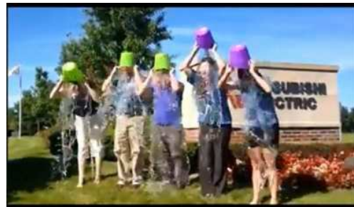
The PEACE Committee from MEAA/Northville, Michigan also joins in!