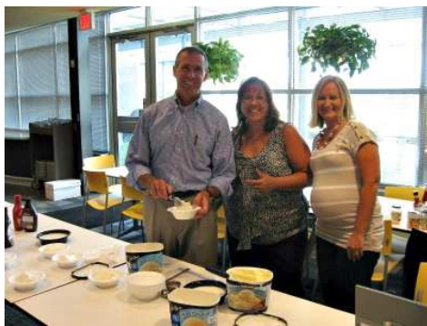
HOPE Committee at MEPPI-Warrendale, PA hosts an Ice Cream Social for Western Pennsylvania School for the Deaf