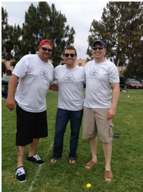
The LIFT Committee from MEUS-San Diego participated in a Bocce Ball Summer FUNdraiser to benefit ReSpectrum , Autism Services in San Diego.