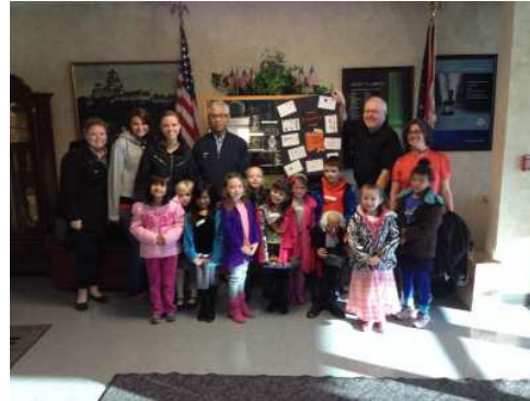
ECHO Committee at MEAA-Mason, OH

Over the past year, employee volunteers at five locations, along with vendors and students from the community teed up to play in the 6th annual company-wide Mitsubishi Electric Hallway Golf Tournament . The event raised $40,000 for six special education schools and non-profit organizations.