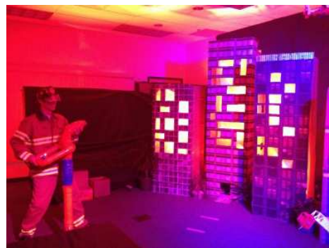
The winning Firefighter hole from the PEACE Committee at MEAA-Michigan

To encourage friendly competition and recognize committees for their hard work, MEAF awarded trophies for the Most Creative Hole and Most Money Raised. This year both awards went to the PEACE Committee at MEAA-Northville, MI . Their interactive role-playing hole had volunteer golfers acting as firefighters to put out a fake fire with their golf balls. Talk about a hole in one!