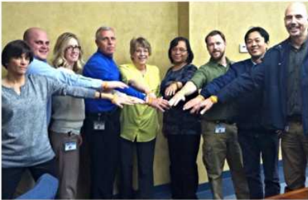
Top: Close-up of bracelet Bottom: Employees with the bracelets

The ECHO Committee at Mitsubishi Electric Automotive America in Mason, OH sold these bracelets that say "Philippines 2013" and raised $1,116 to help those affected by Typhoon Haiyan in the Philippines.