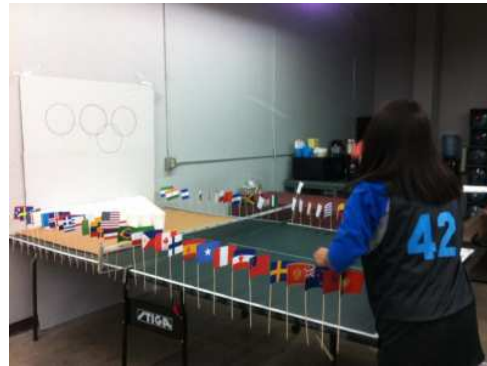
Playing Ping Pong with the GIVE Committee from MEAA-Garden Grove, CA

This year in addition to Hallway Golf some volunteer committees branched off to host some innovative fundraisers like the GIVE Committee from MEAA-Garden Grove, CA who created a Mitsubishi Olympics fundraiser!