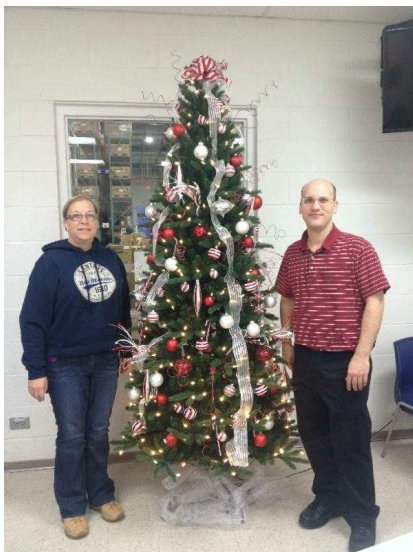
The VISION Committee at MEAU-Vernon Hills helped decorate the Warehouse lunch room with this festive tree while the proceeds supported the Special Recreation Association of Central Lake County .