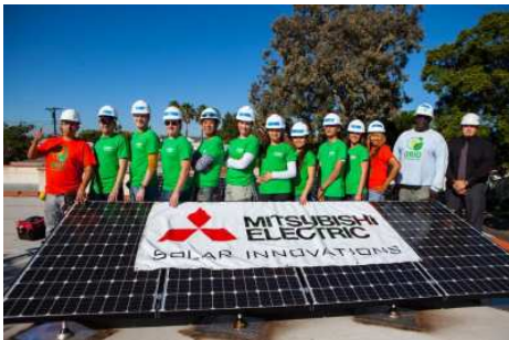
Mitsubishi Electric volunteers and University students installed the solar system.

The ACTiVe Committee and Green Team (a volunteer group committed to helping the environment) at Mitsubishi Electric, US with the support of MEAF partnered with Grid Alternatives and California State University Long Beach Disabled Student Services to install donated solar panels on a North Long Beach home.