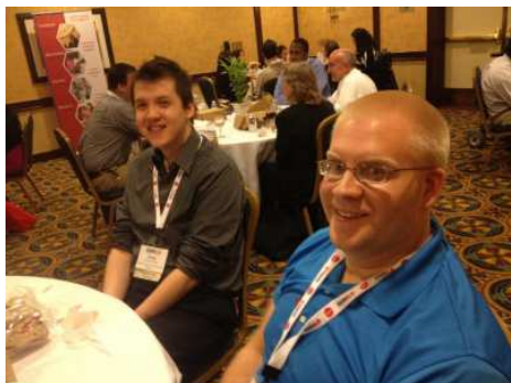
Career Link Mentees at lunch

MEAF also hosted a Power Lunch where national grant partners, Mitsubishi Electric US volunteers, and interns from USBLN's Career Link Mentoring Program could network and share best practices.