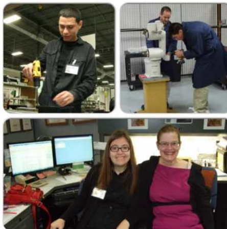
Upper Left: Student works in assembly

repair, accounting, customer service, administration, manufacturing and the warehouse.