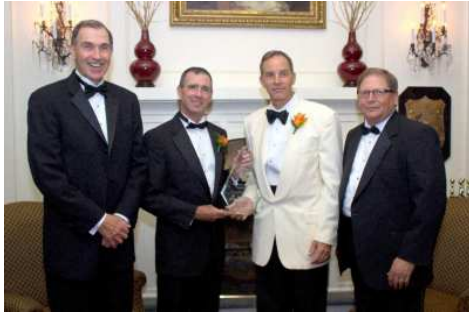
Woodlands Foundation honors MEPPI/Warrendale and HOPE Committee for their support and dedication to children with disabilities.