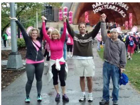
Mitsubishi Electric Research Labs in Cambridge, MA Makes Strides for Breast Cancer with American Cancer Society .

As part of WI's Canoe Mobile program, which travels to communities in the eastern US, Project WILD experiences took place in Minneapolis, MN, Sidney, OH, and Washington, DC. Project SEARCH participants have already reported how the experience has changed their lives, helping to build their self-confidence, and exposing them to new career opportunities in the out-of-doors.