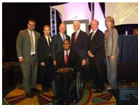
Some of the speakers from the lunch plenary

MEAF was proud and honored to be a part of the US Business Leadership Network (USBLN) Conference in Los Angeles this Fall. MEAF, MEUS, Marriott, and organizations hosting interns with disabilities were front and center at a lunch plenary to kick off National Disability Employment Awareness Month on October 1st.