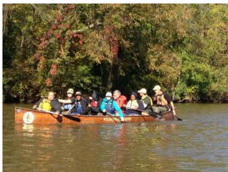
Project SEARCH participants canoe on the river

As part of WI's Canoe Mobile program, which travels to communities in the eastern US, Project WILD experiences took place in Minneapolis, MN, Sidney, OH, and Washington, DC. Project SEARCH participants have already reported how the experience has changed their lives, helping to build their self-confidence, and exposing them to new career opportunities in the out-of-doors.