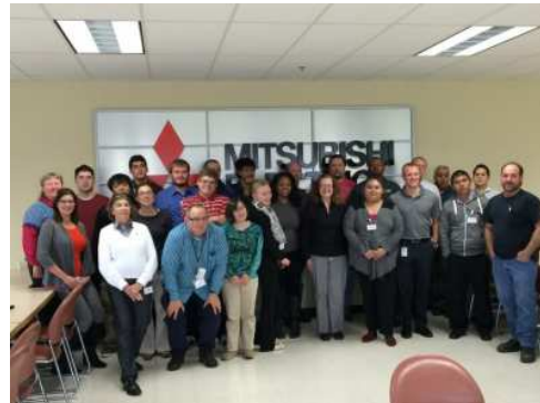
VISION volunteers and students from SEDOL during Disability Mentoring Day

October is National Disability Employment Awareness Month (NDEAM) and it's a time when businesses open up their doors to allow students with disabilities an opportunity to learn about different career paths.