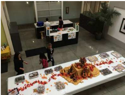
DREAM Committee from MEUS in Cypress, CA holds a bake sale!