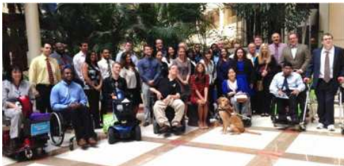
USBLN Career Link Mentees

MEAF was proud to be a part of the US Business Leadership Network (USBLN) Conference in Orlando, FL this Fall.