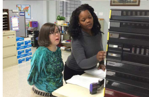
Top: Student works in Accounting with his mentor