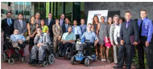
USBLN Career Link Mentees and Mentors

MEAF is a proud supporter of the USBLN's Career Link Mentoring Program.